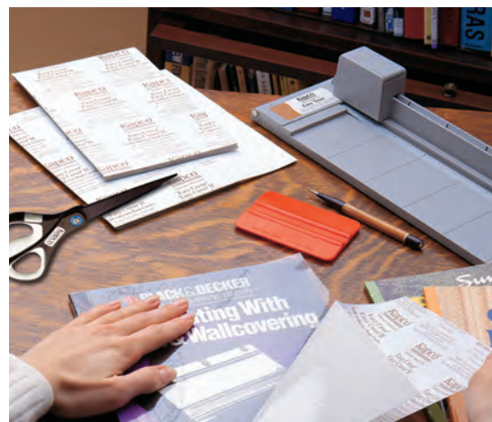
EASY COVER II

Mix & Match Any Size To Receive Quantity Discounts