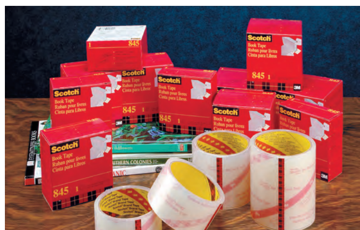
SCOTCH™ 3M™ 845 TAPE