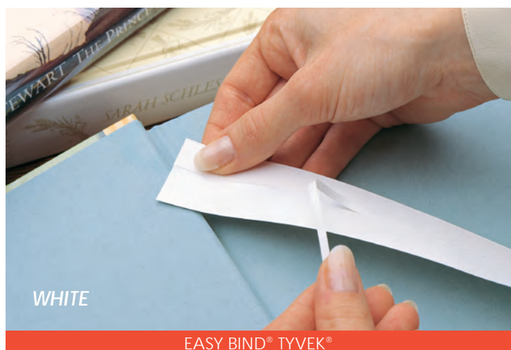
EASY BIND® TYVEK®

Sample Available in Book Protection Packet.