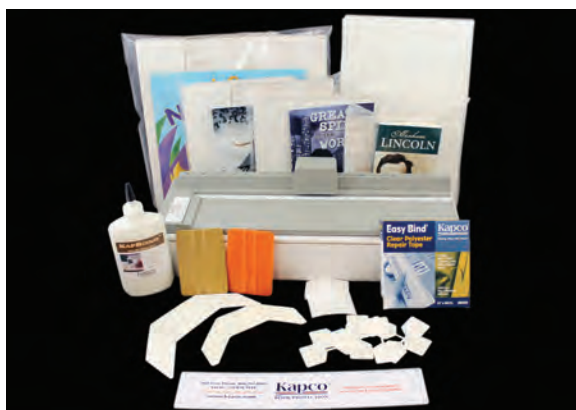
DELUXE BOOK PROTECTION KIT