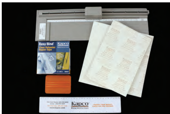
PAPERBACK BOOK PROTECTION KIT