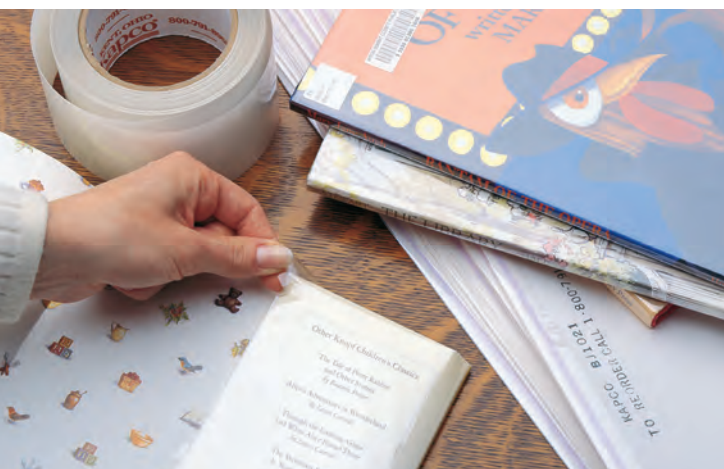
BOOK JACKET ATTACHMENT TAPE