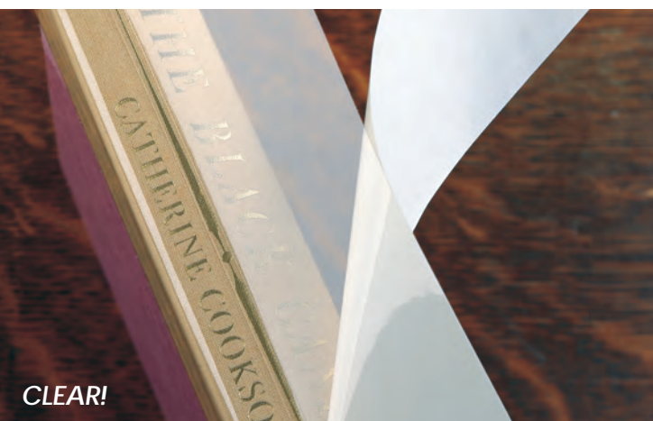
EASY BIND® II

Mix & Match Any Size To Receive Quantity Discounts